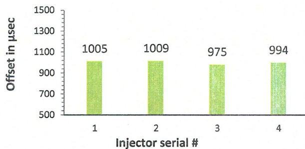
Injector Offset Matching Data

Matching individual injector dynamic flow rates, called the slope of the injector, results in matched AFR's benefitting good idle, cruise and startup.